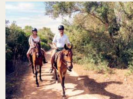
Horse Riding Club.