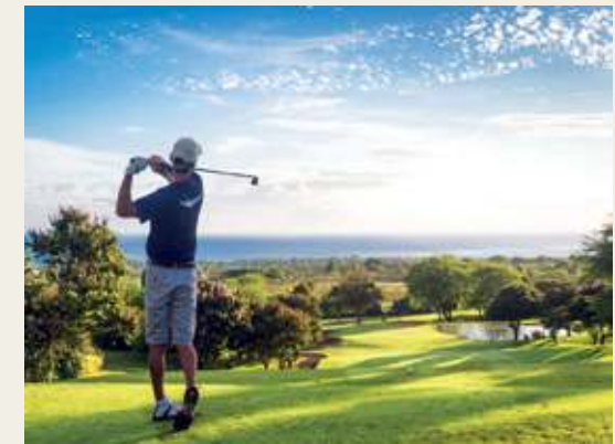
Chaparral, Golf Club.