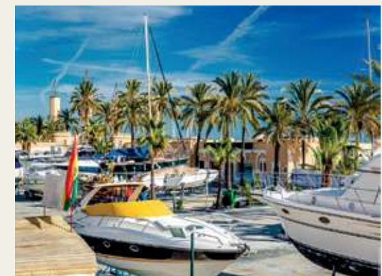
Fuengirola Leisure Marina.