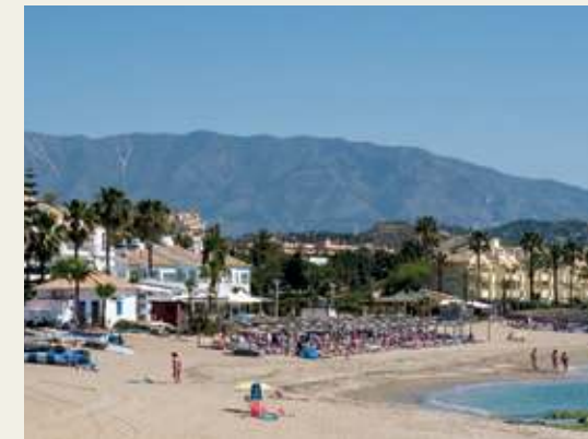
Cala de Mijas Beach.