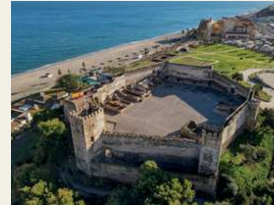
Sohail Castle, Mijas Coast.