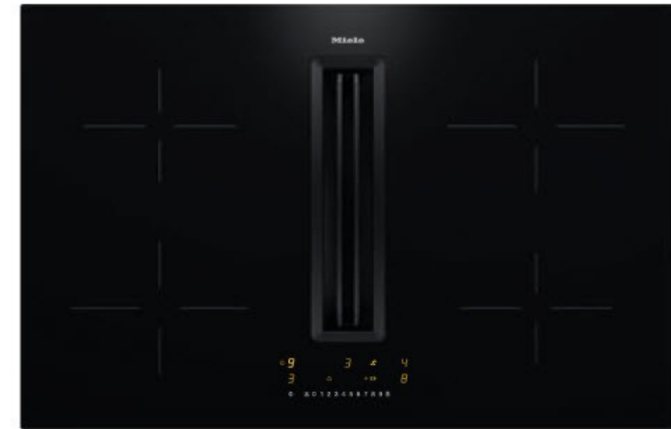
HOB AND EXTRACTOR HOOD MIELE KMDA 7272 FL