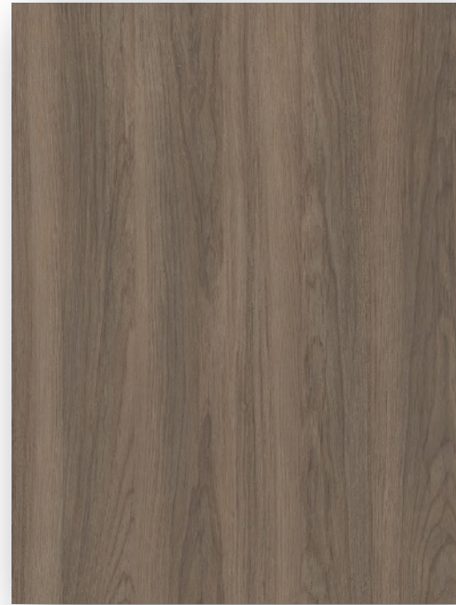
Wall units and island base units: wood effect laminate, Nocedo 15 SD