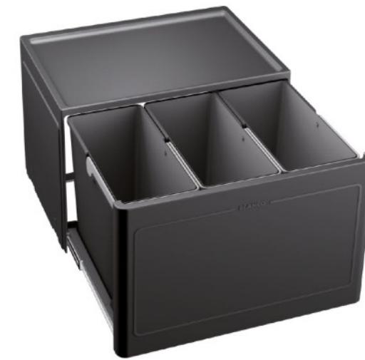
WASTE BINS (TYPES 1 + 2) BOTTON PRO