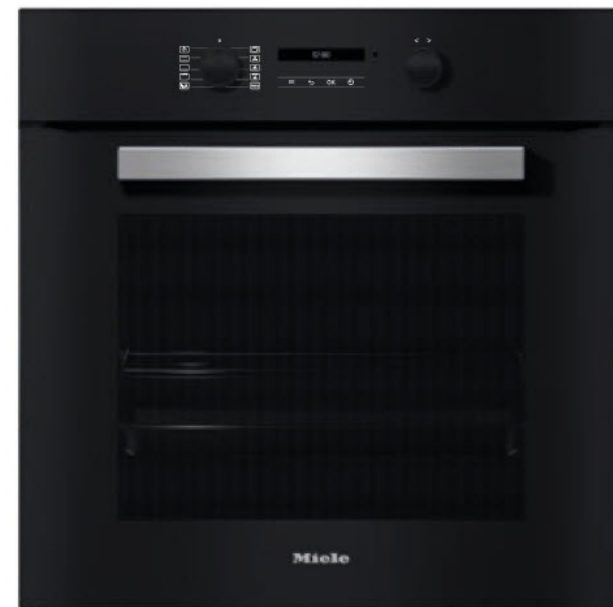
OVEN MIELE H 2467 B OBS