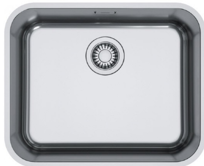
KITCHEN SINK FRANKE SRX 111-50