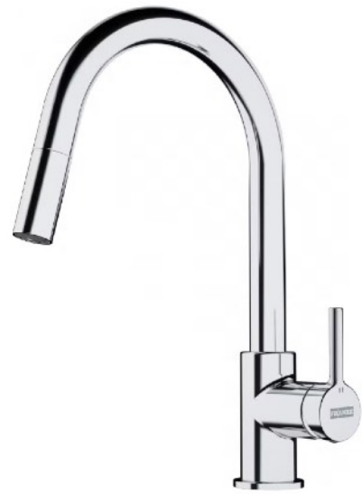
KITCHEN TAP FRANKE LINA EXTRAÍBLE