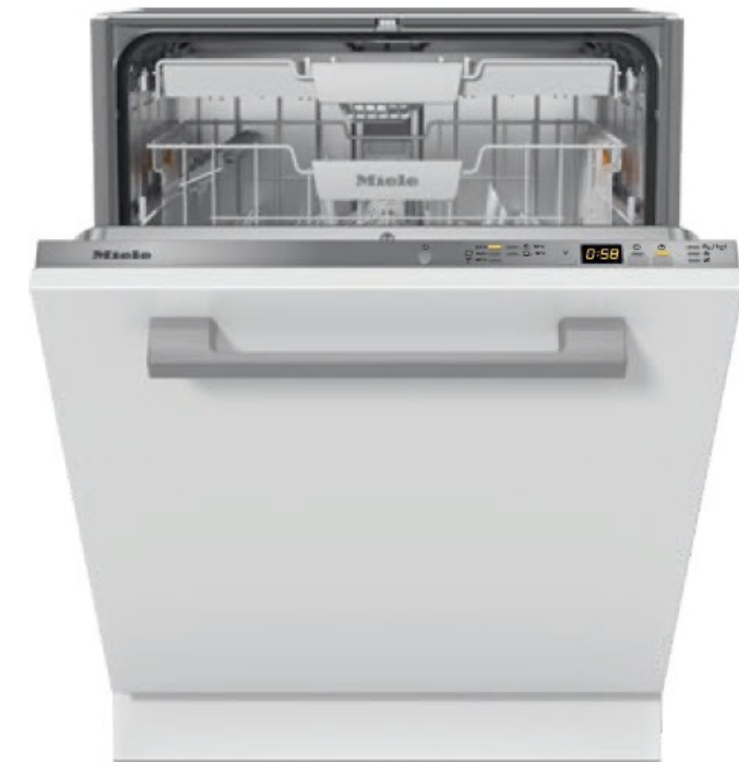
DISHWASHER MIELE G 5651 SCVI