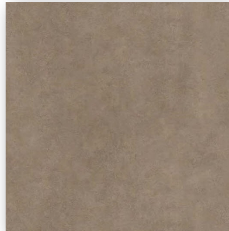
Laminam worktop: Fokos Terra, 12 mm thickness