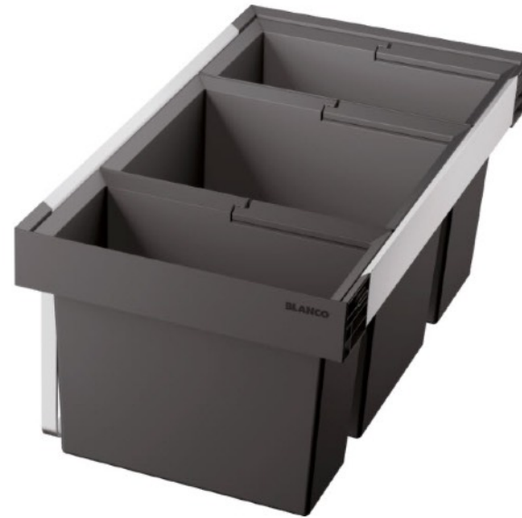
WASTE BINS (TYPE 3) FLEXON II