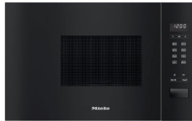
MICROWAVE MIELE M 2230 SC OBS