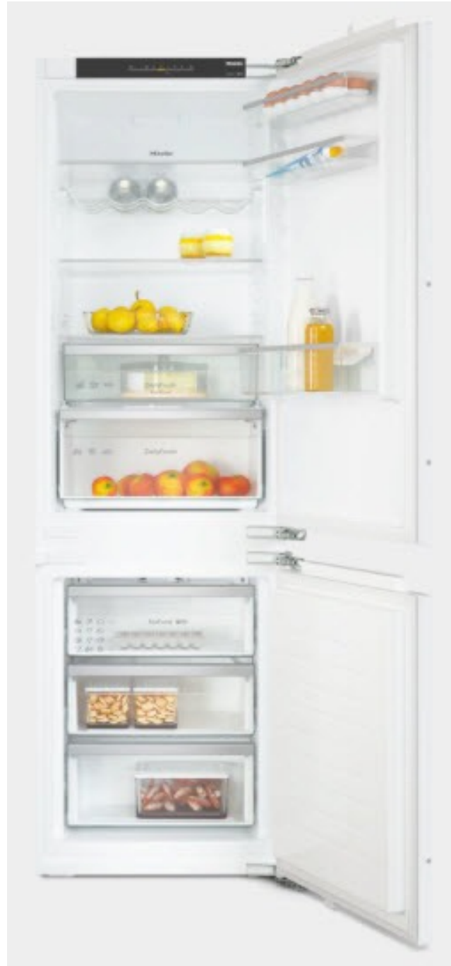
INTEGRATED FRIDGE FREEZER MIELE KDN 7724 E