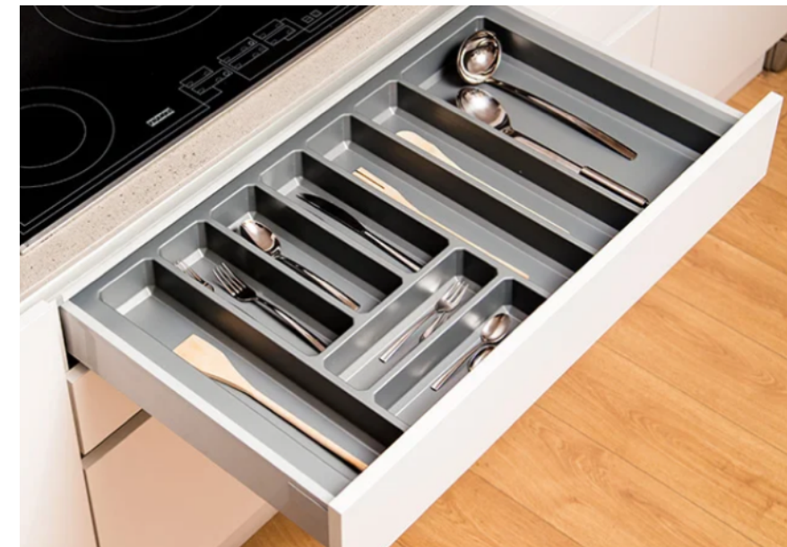
ABS CUTLERY TRAY