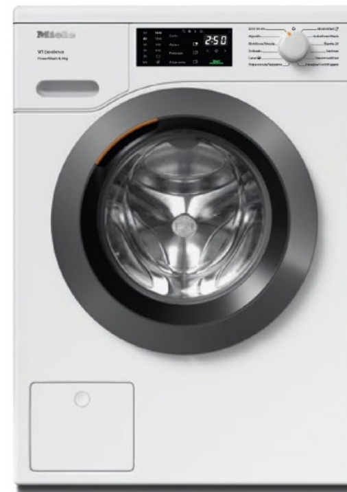
WASHING MACHINE MIELE WEB 365 PWASH